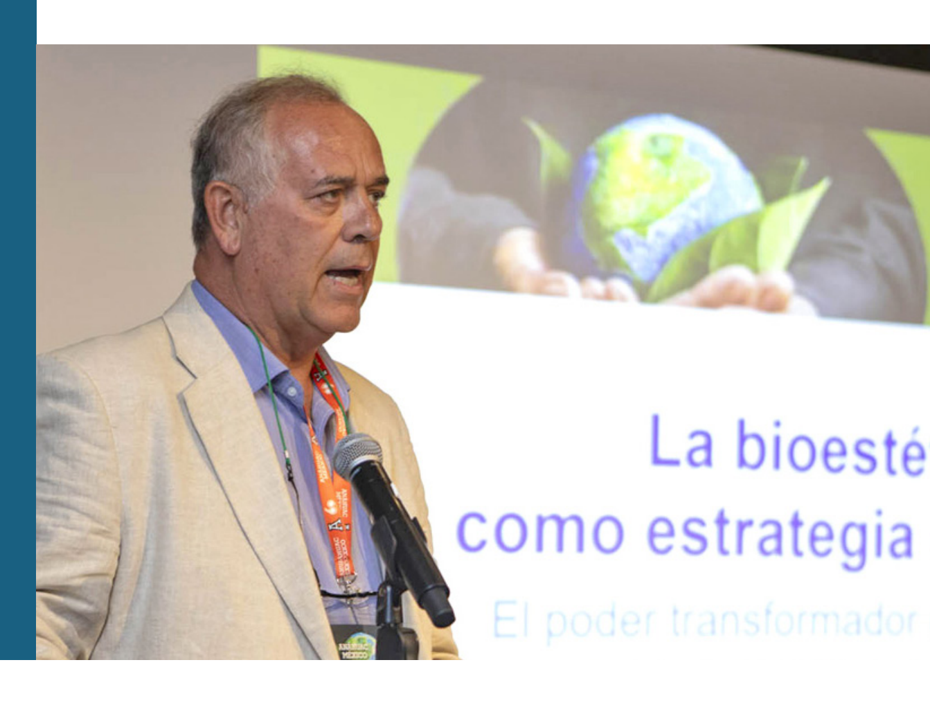
Day 1 | First session

These sessions highlighted the breadth and depth of ethics education and its role in addressing contemporary global challenges.